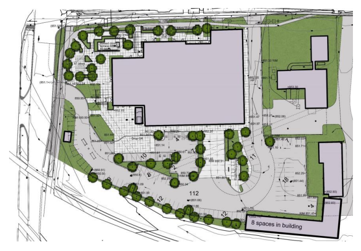
Preliminary Public Market Site Plan presented to the Urban Design Commission in June.

The design team provided a preliminary informational presentation to the Urban Design Commission in August. That UDC submittal can be found online here.